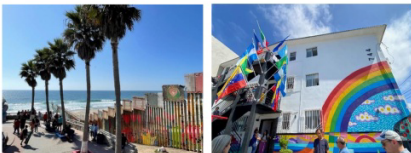
Border Wall in Tijuana - Friendship Park

San Diego Border: Tijuana - A Hub of Culture and Movement June 30 – July 4, 2023