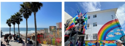
Border Wall in Tijuana - Friendship Park

San Diego Border: Tijuana - A Hub of Culture and Movement June 30 – July 4, 2023